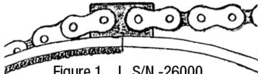
Figure 1 L, S/N -26000 M, S/N -24700

If you have an early model combine, ensure there are enough chain links to tie the ends together and allow for some slack.